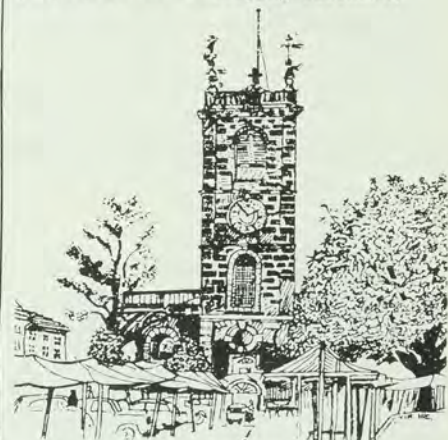
The Parish Church and Market Place

Under the guidance of Benjamin Wilson, the leading brewer in the town, a highly organised ale trade developed between Burton and the Baltic ports. The excellent keeping qualities of the ale, derived from the characteristics of the local water supply and the use of high grade malt, enabled it to reach St Petersburg, Danzig, Riga and Elbing in a fine sparkling state and thus command a high price. Moreover, the insatiable demand in the Midlands for Baltic iron, timber and other import commodities allowed the exporting brewers to develop a lucrative trade. By 1780 there were thirteen breweries in the town, including those of Benjamin Wilson (sold to Samuel Allsopp in 1807), William Worthington and William Bass, who was also the proprietor of a carrying business.