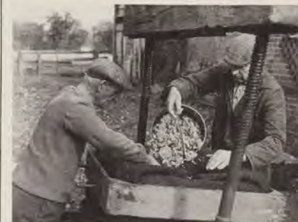
Filling a cider hair with pulped apple

It was consequently a good thirst quenching drink for farm workers, particularly at haymaking or harvest; there were plenty of cases of individuals drinking 1-1½ gallons a day.