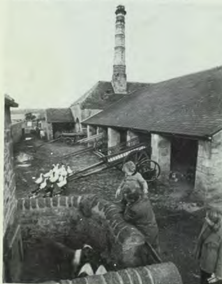
Home Farm, Beamish Museum