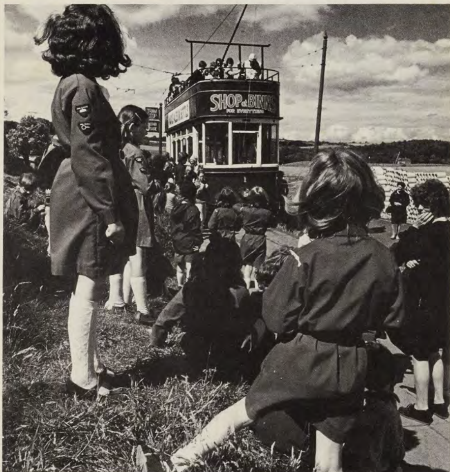
Electric Tramcar at Beamish