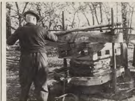
Putting the pressure on the 'cheese'

The fermentation process relied completely on wild yeasts brought in on the fruit or present on the cloths or equipment; it was essentially a wine fermenta-