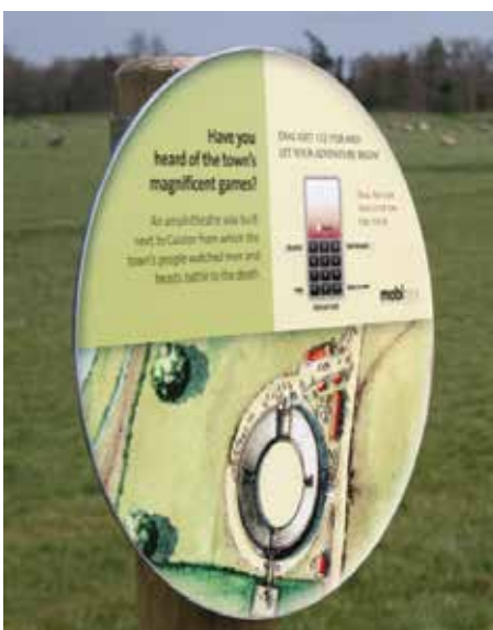
BELOW: A stopping point on the Caistor tour.

This layered approach is one of many advantages of the mobile phone tour. According to Mike: 'It can deliver more in-depth information than the interpretation boards we've had here for a while and it's interactive. We've found that people start listening to the