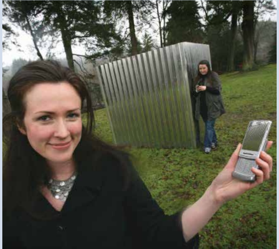
ABOVE: Striking art draws the public in.

Like any journey into the unknown, it has been a rocky road with many surprises along the way. The Tyne Salmon Trail has been a departure from the norm for the Environment Agency, and has not been without its challenges. But the use of Bluetooth has been groundbreaking for us and has provided an excellent testing bed for the potential use of this technology for flood warnings in areas with