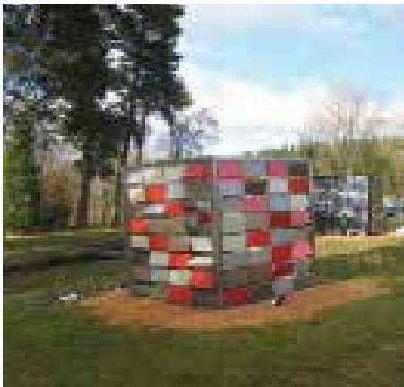
ABOVE: Ten cubes are inspired by the colour of the salmon and their scales.