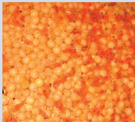
ABOVE: This image of salmon eggs and alevin (baby fish) is sent as a keepsake.